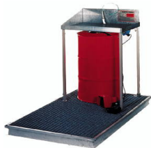
rhoba small part cleaner