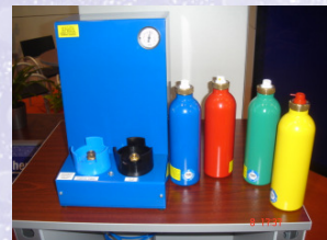
refillable rhoba -AIRSPRAYCAN ASD with automatic filling machine (optional)